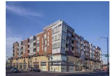
Affordable Housing/Mixed Use