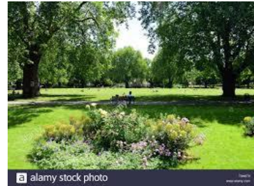
Park, Trails, Open Space